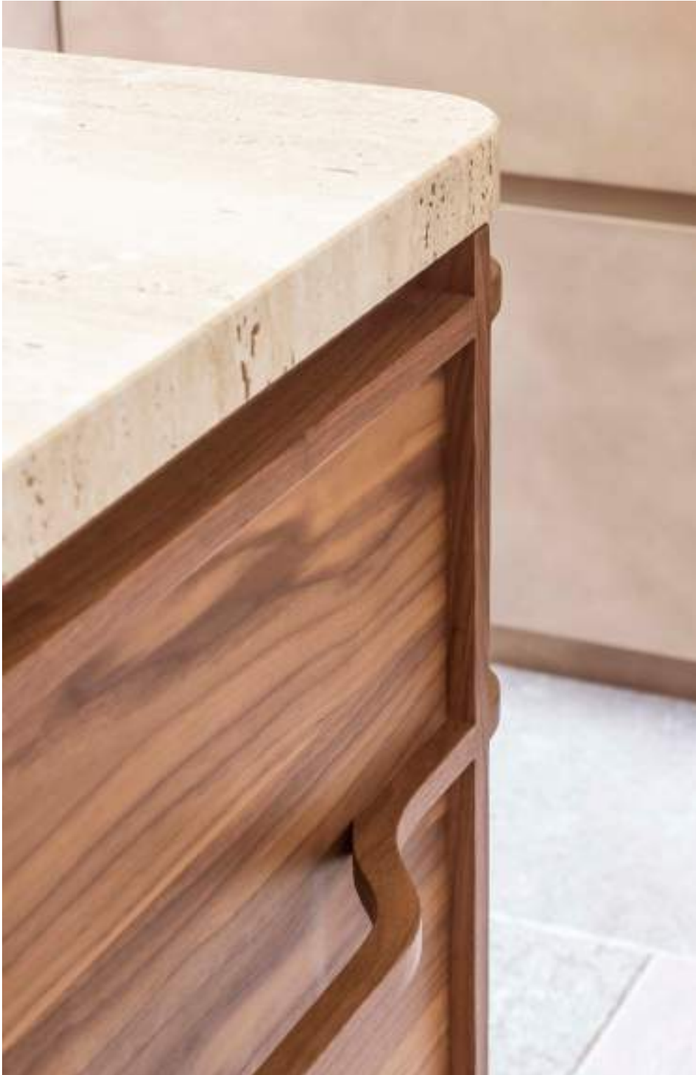
Caprini & Pellerin used solid wood so that they could carve out the handles and towel holders, creating intricate details and rounded angles in the cabinetry.