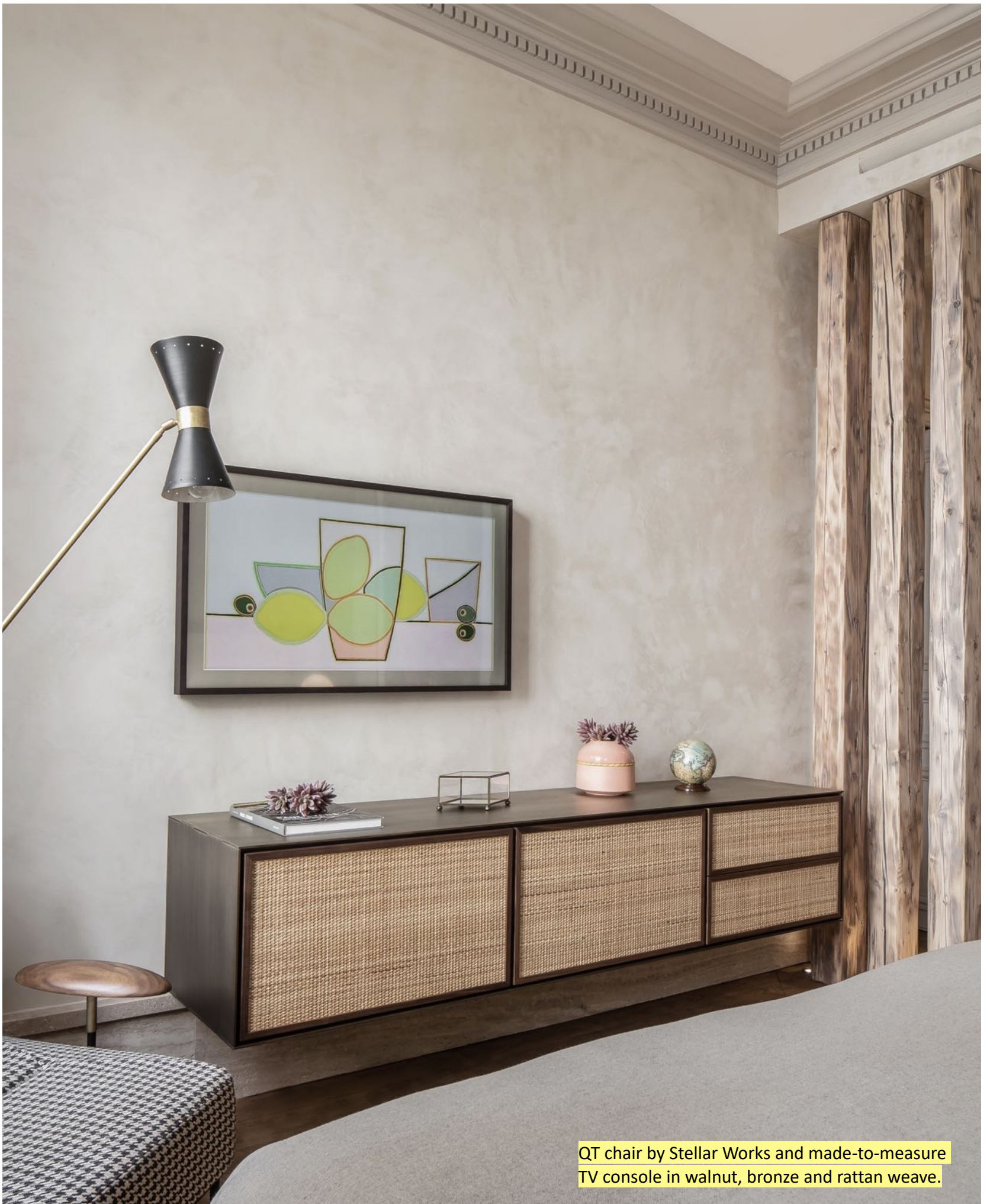
QT chair by Stellar Works and made-to-measure TV console in walnut, bronze and rattan weave.